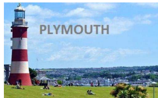
National Marine Aquarium, Plymouth