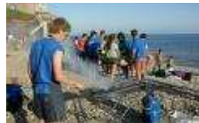
Barbecue Night at May Cottage