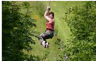
Ashcombe Activity Park – Zip Wires