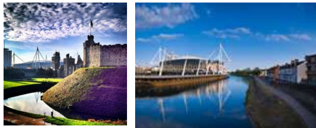
Cardiff Castle, the Millennium Stadium